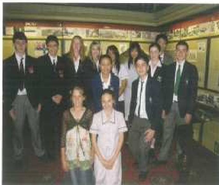
NSW State Prizewinners at Parliament House Sydney