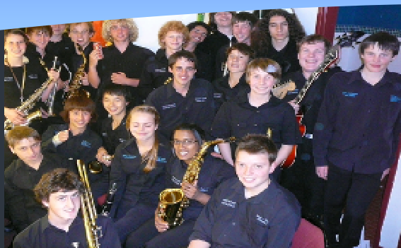
MHS Jazz Ensemble