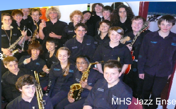
MHS Jazz Ensemble