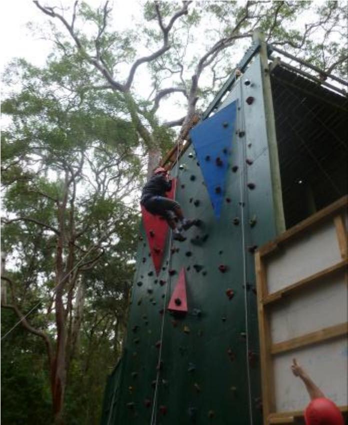
Andrew abseiling down the rock wall after reaching the top