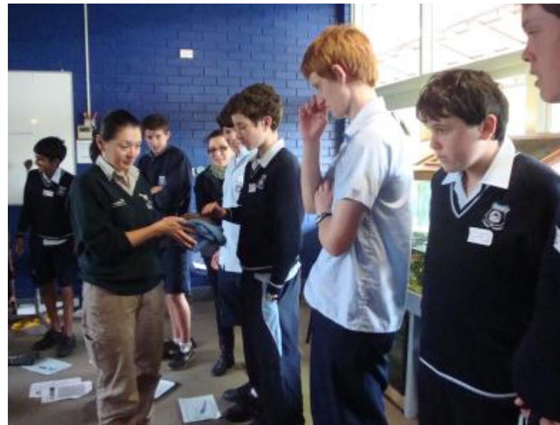
Year 8 students were taught about Australian native animals in German

A big thank you to staff who accompanied the students on their excursion and to the rangers at Taronga Zoo and the Goethe Institute for organising such an amazing day.