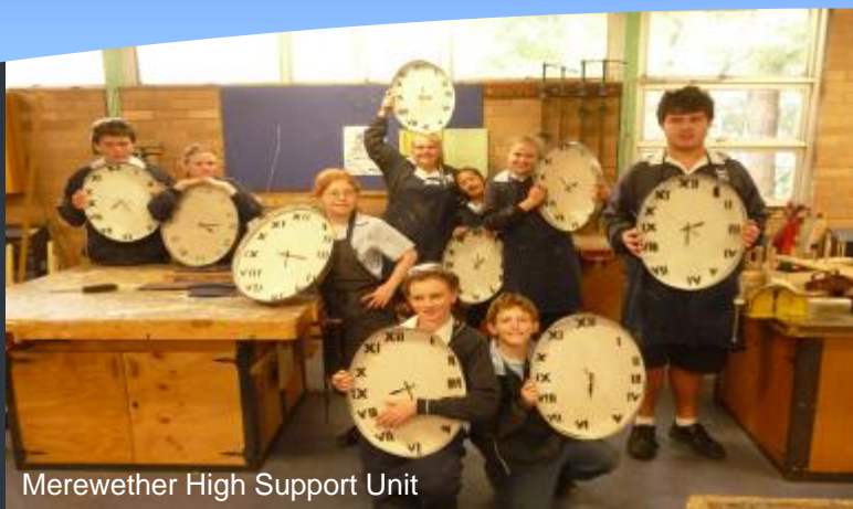
Merewether High Support Unit