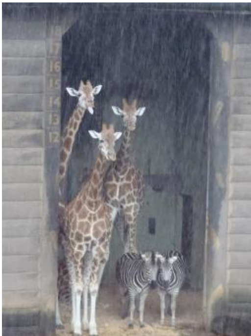
Even the giraffes took pity on the zebras and shared their shelter in the torrential downpour

Our students enjoyed bilingual instruction on native animals in the zoo's education centre. They asked and answered questions about the animals in German, witnessed an amazing bird show and completed a treasure hunt..... all in German!