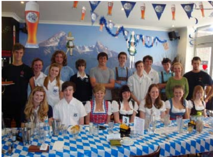
Guten Appetit !

German students from Years 10 and 11 enjoyed a 'foodie' excursion to Oma's Kitchen in Newcastle.