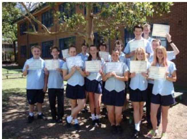
Year 9 German students show off their MLTA certificates

The students had a great time making the film, and it was a great learning experience. They took on various roles in the production of the film, including writing the script, directing, filming, producing and editing.