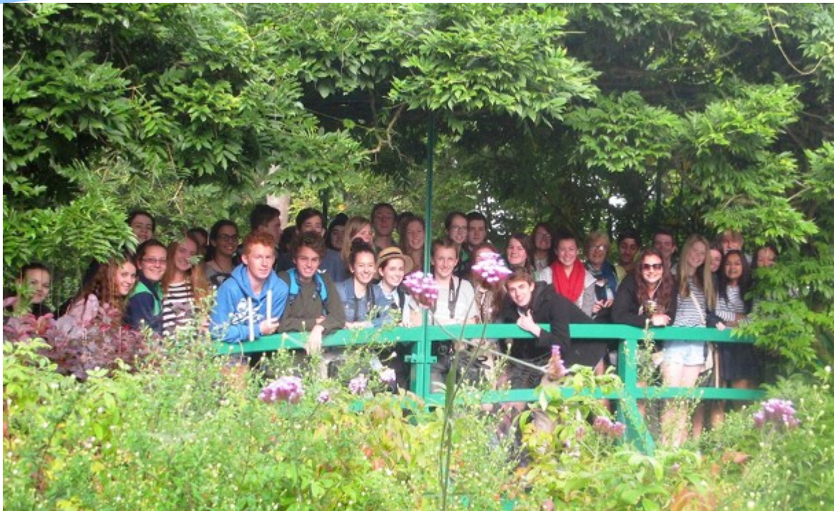
French and Visual Arts students at Monet's Garden