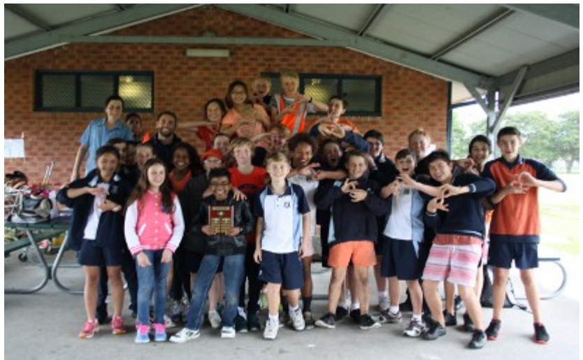
7G – INDIA – Year 7 Gala Day Champion Team!!!

Very special thanks to our Year 9 and 10 PASS students who were fantastic in their respective roles of referees and coaches