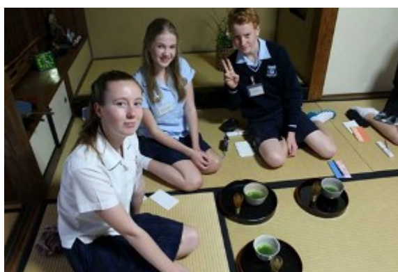
Merewether High students with the Mayor of Ube Tea Ceremony