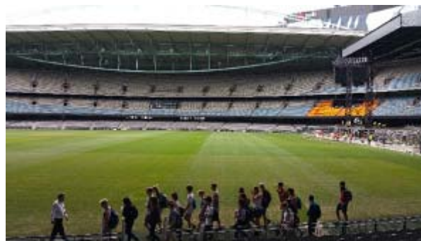
Etihad Stadium Tour, The Docklands, and learning about homelessness and marginalised people in the city at The Big Issue classroom, Melbourne CBD.