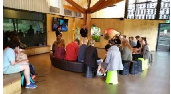
The new classroom within the lion exhibit at Melbourne Zoo