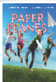
Paper Planes (G)

♥ A Fundraising Evening for Bali Hearts and Hands ♥