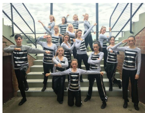
Our dancers this year in (left) The World Turned Upside Down and (right)