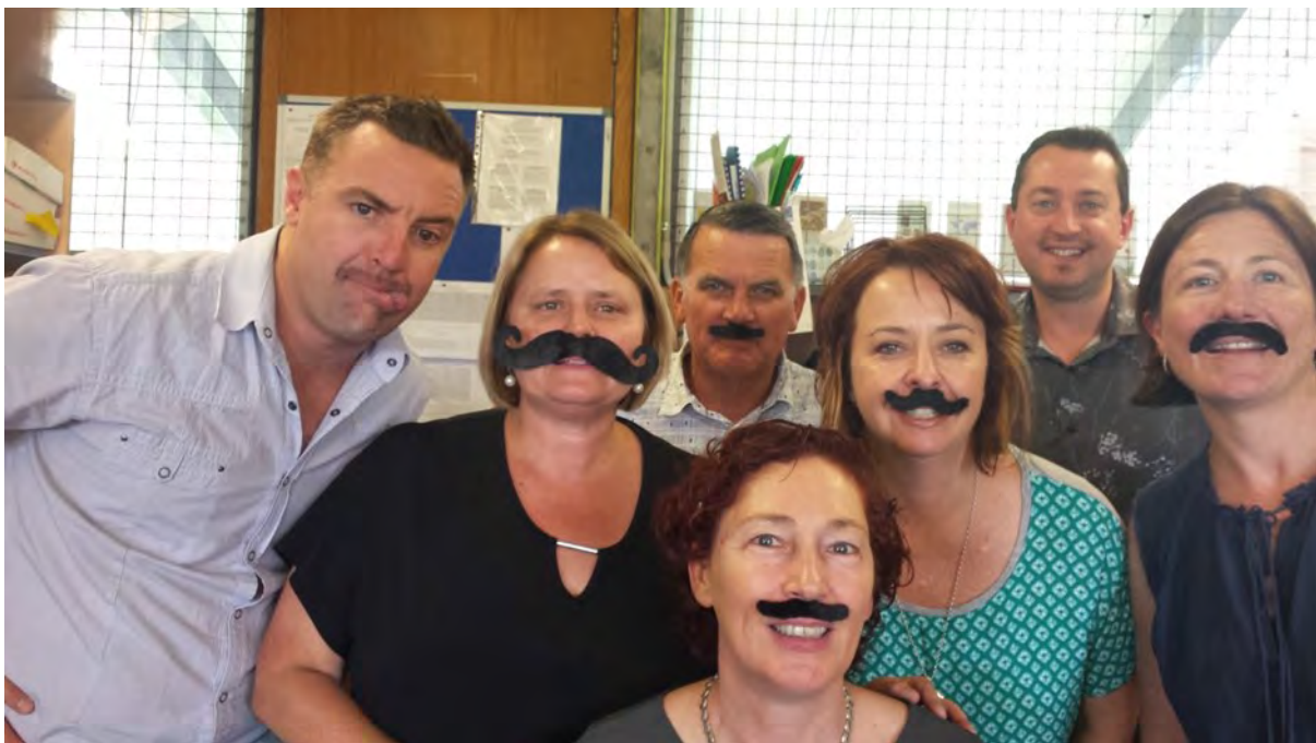
The Social Science Faculty proudly supports Movember

The Social Science Faculty proudly supports Movember.