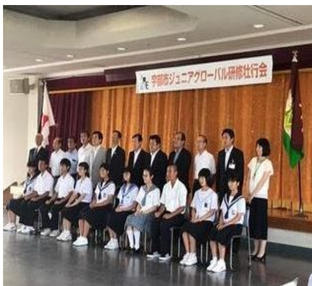
Photo: The students and teachers at school before they left Japan